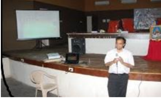
(Speech by District Development Officer, Rajkot)