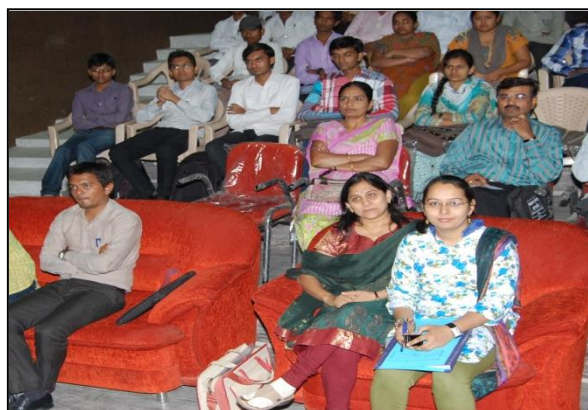
(Participant ,Government Official of Vishwakarma Yojana)